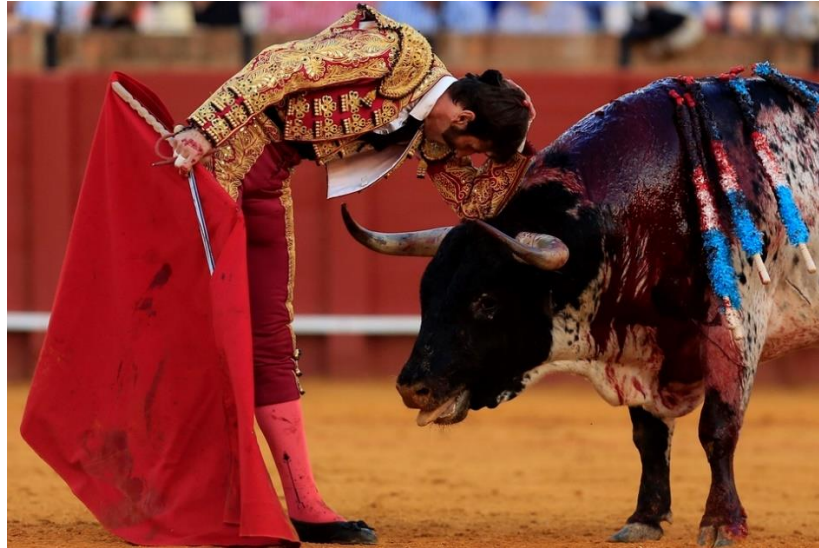
Spanish matador Juan Jose Padilla leans on a bull during a bullfight at The Maestranza bullring in Seville