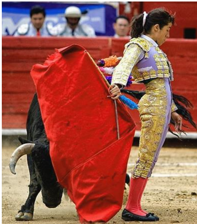
Mujeres de Alternativa bullfightingnews.com

And meet immigrant Extranjeras — Foreign Women in Spain .