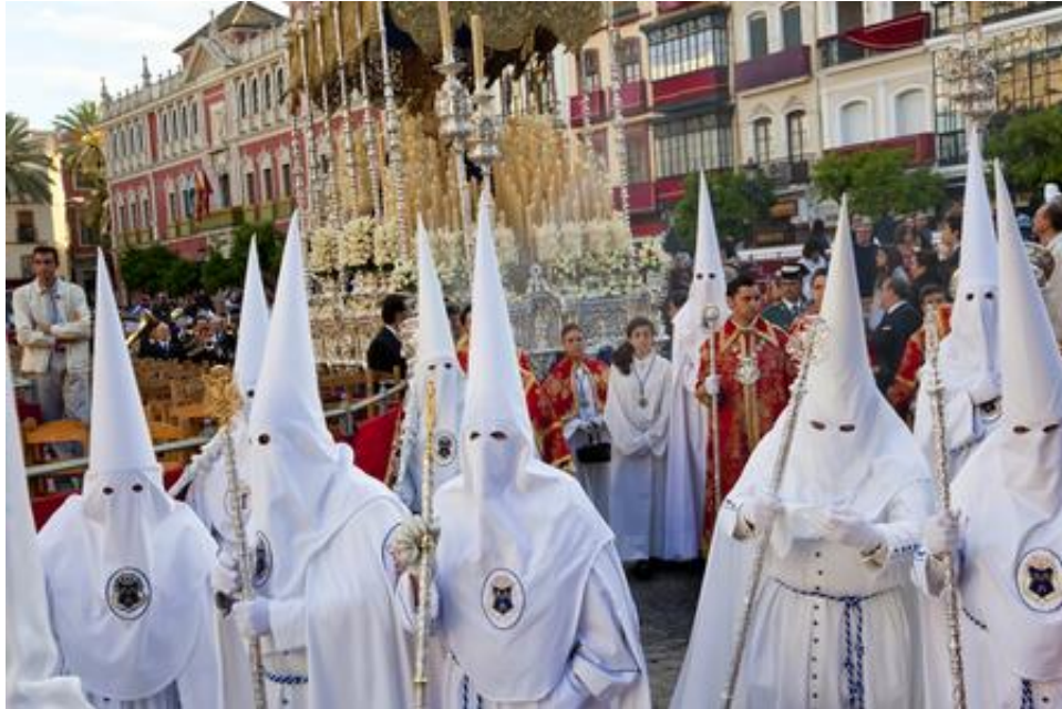
Seville, Spain - April, 2011: Semana Santa de Sevilla Fiesta Easter Andalusia

Holy Week ends there, as in all Catholic Countries, on Easter Sunday.